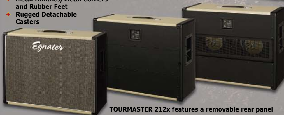
TOURMASTER 212x features a removable rear panel